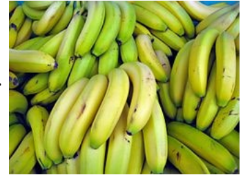
Cavendish bananas

Noteworthy was the first report of the virulent TR4 race of Panama disease in banana in Africa (Mozambique), from where it is spreading around the continent. It was already decimating Cavendish bananas throughout Southeast Asia, and in November 2013 was reported in Jordan. It is of particular concern because the Cavendish banana is the main commercialized type of banana, which is resistant to all other races of Panama disease.