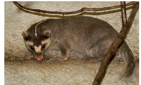
Chinese ferret-badger

Reports of anthrax in humans, sometimes without a known animal source, came from Republic of Georgia, Kenya & Zimbabwe, and in livestock without associated human infection from Argentina, Indonesia, Sweden & Togo. Rabies cases were reported from India, Indonesia and South Africa, and in animals without associated human cases in the Congo Republic, Israel, Taiwan and the USA. The Taiwan infections were first discovered last year in Chinese ferret-badgers, which are a species of the mustelid family living in the mountain forests, among which rabies may have been lurking undetected for decades.